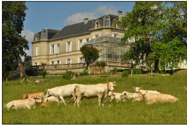
Blonde of Aquitaine